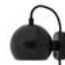
Matt black. Art.no. 104755