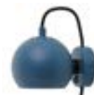
Matt petrol blue. Art.no. 104739