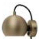
Matt antique brass. Art.no. 104741