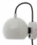
Glossy pale grey. Art.no. 123400 Black fabric cord