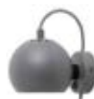
Matt light grey. Art.no. 104747