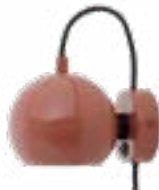
Glossy red. Art.no. 123399 Black fabric cord