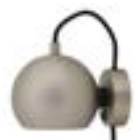
Matt brushed satin. Art.no. 104751