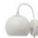
Matt white. Art.no. 104756