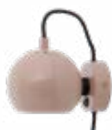
Glossy Nude. Art.no. 123397 Black fabric cord

Assembly Instructions: See and/or download here .