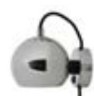
Glossy chrome. Art.no. 104753