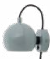
Glossy mint. Art.no. 123398 Black fabric cord