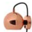
Glossy copper. Art.no. 104744