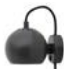
Matt dark grey. Art.no. 104740