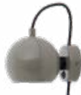
Glossy warm grey. Art.no. 123401 Black fabric cord